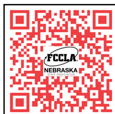
Member of the Month