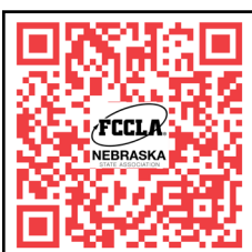
Adviser of the Month