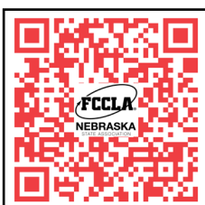
Chapter of the Month