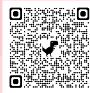
Adviser of the Month