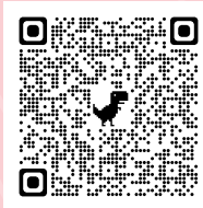
Chapter of the Month